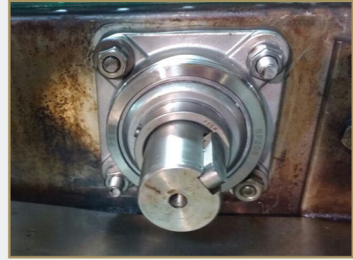
PEER Bearing after 1 year in use.