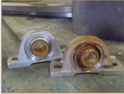
Competitor after 90 days in use.

On the left side, a competitor's bearing after 90 days vs. PEER Bearing after 1 year on the right side.