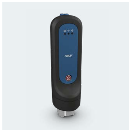
SKF QuickCollect Sensor

SKF ProCollect provides on the spot analysis and indications of machine problems and severity, enabling the planning of proactive maintenance and corrective actions.